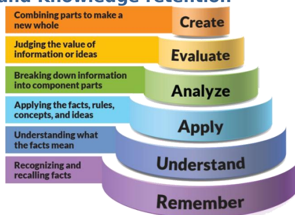
Figure 1: Blooms Taxonomy