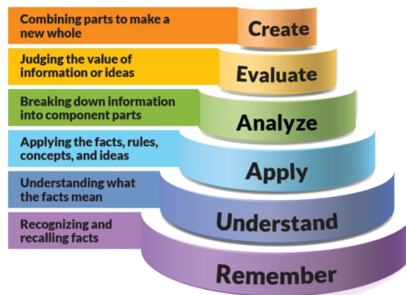
Figure 1: Blooms Taxonomy

(Blooms taxonomy has been given for reference)