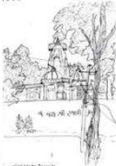
ajari Mata Temple