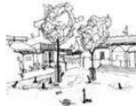
Common Open Space for a cafe