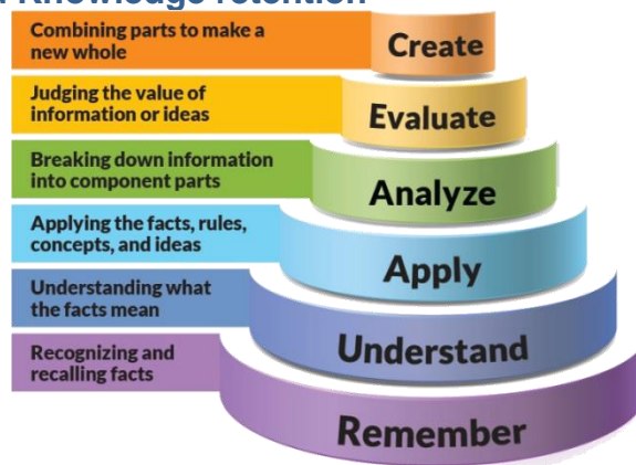
Figure 1: Blooms Taxonomy