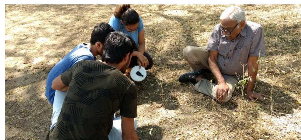
AR 0102 - Design Project Module -01